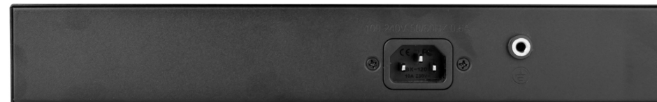
Power input port INPUT:100-240VAC