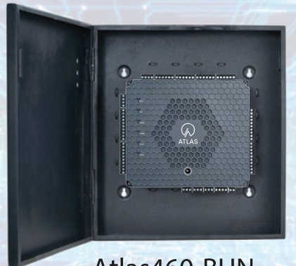
Atlas460-BUN *Also available in 1 or 2 Door options