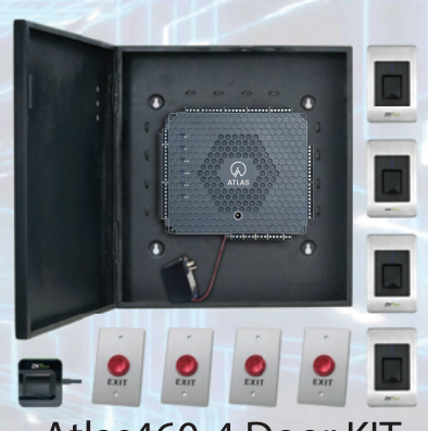
Atlas460-4 Door KIT Also available in 1 or 2 Door options